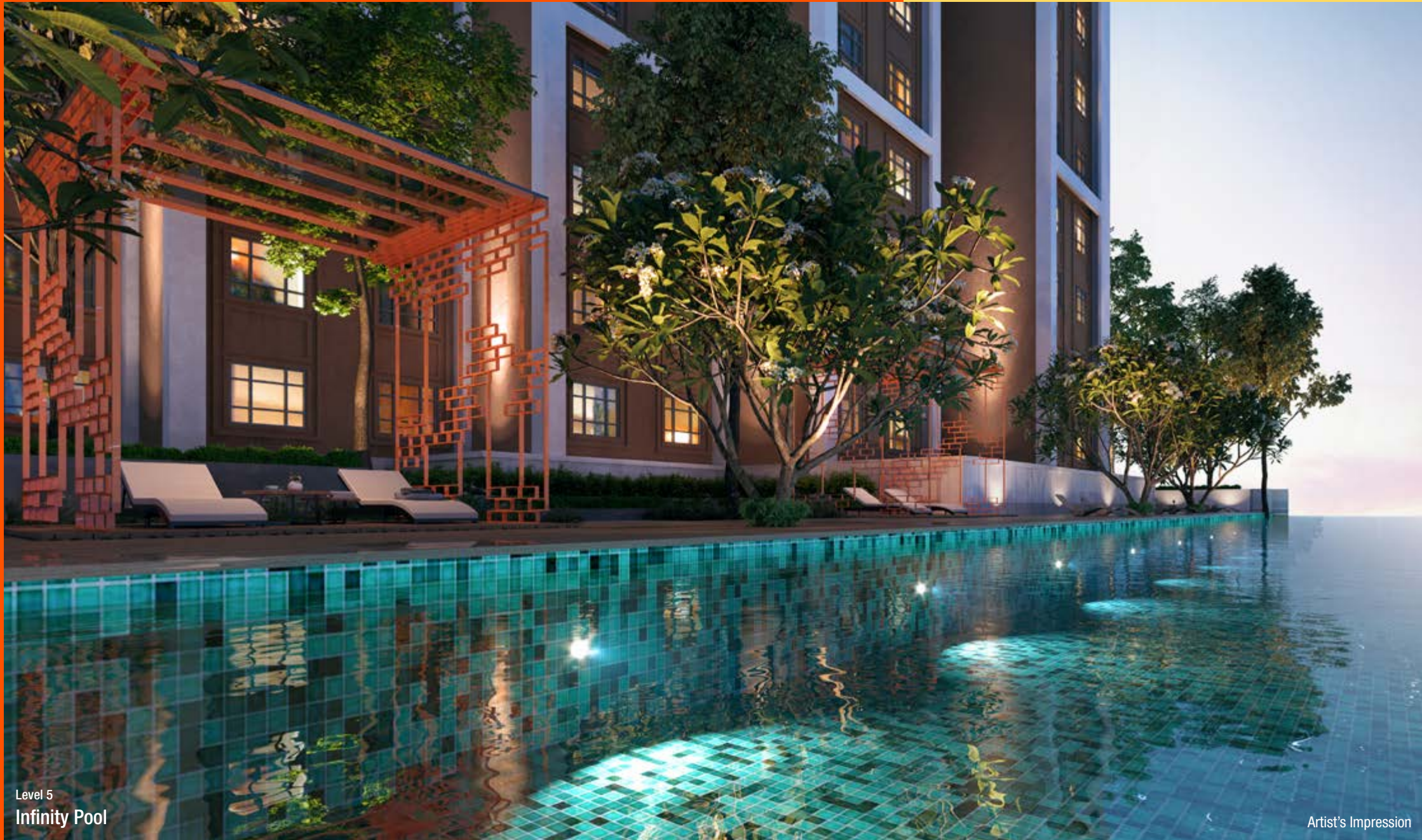
Level 5 Infinity Pool