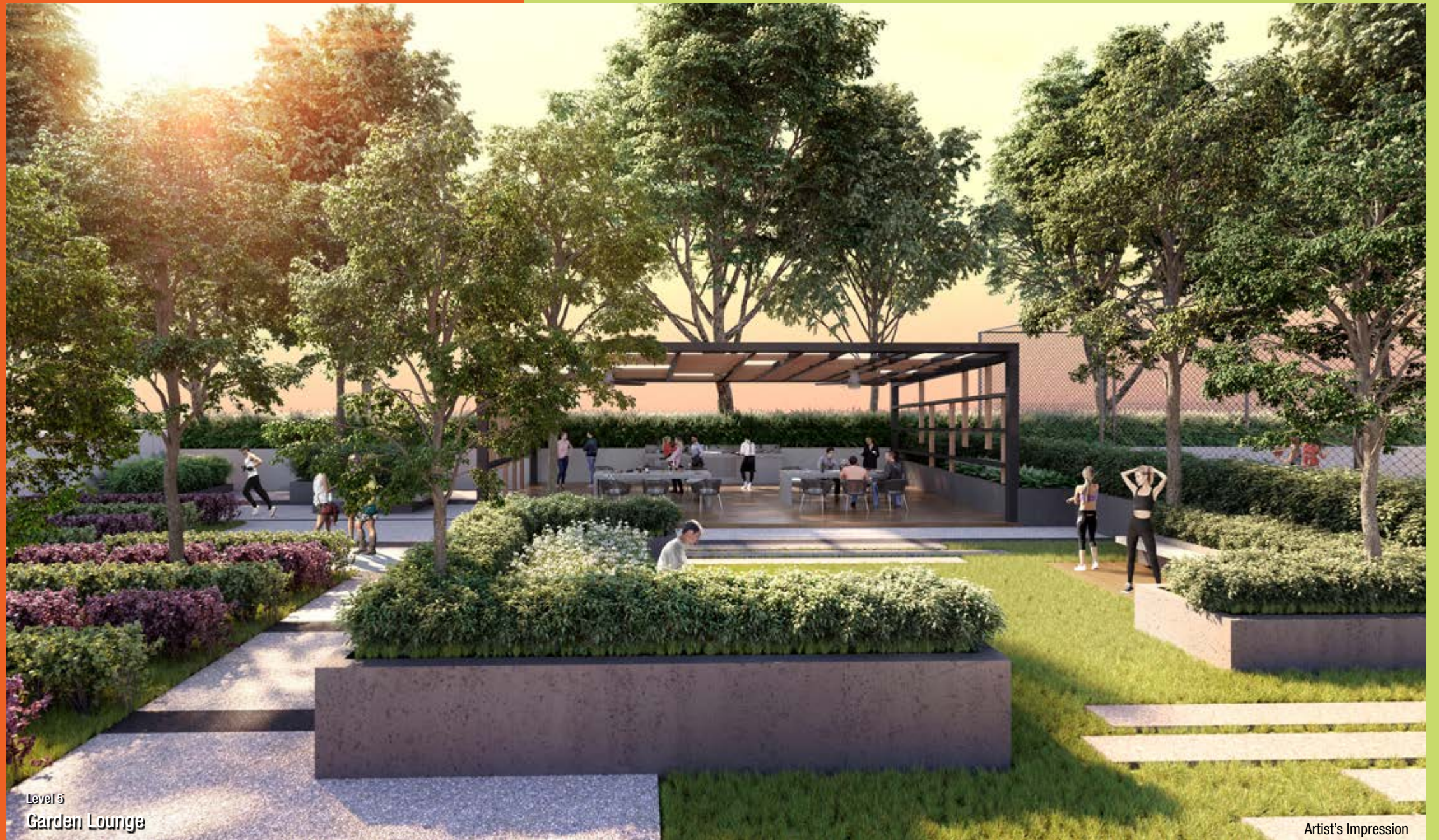
Level 5 Garden Lounge

D'Vine Residences offers a slice of big city living - self-contained, compact, bustling, surrounded by retail and entertainment. The 550 square foot units are designed for a discerning crowd seeking like-minded community and an urban lifestyle. These efficiently-sized units provide for changing needs and lifestyle as well as space for creative design and experimentation.