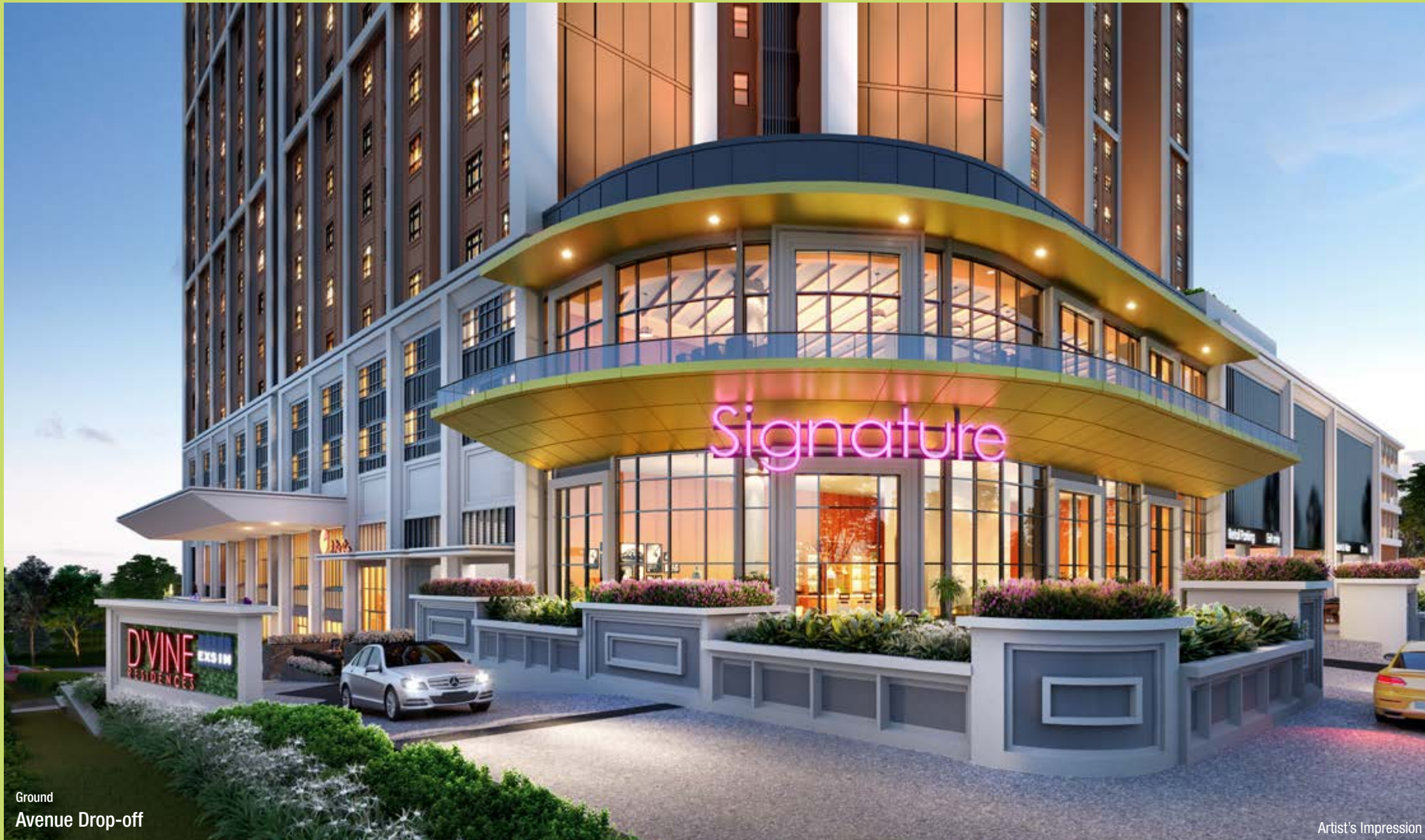
Ground Avenue Drop-off