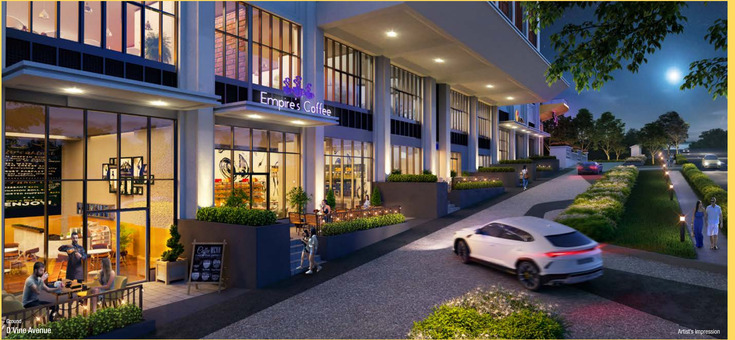
Ground D'Vine Avenue